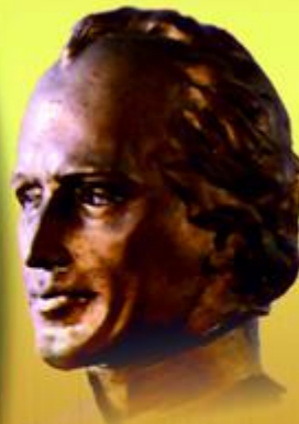
Blessed Fr. Basil Moreau Founder of Holy Cross